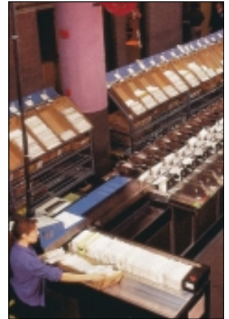
Distribution/ Material Handling